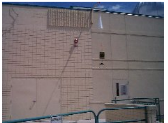
Lee's Near Space capsules outside the observatory.